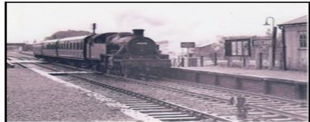
Sealand Station circa 1950