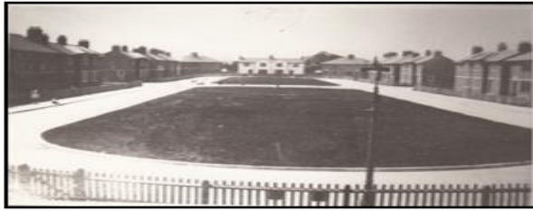
North and South Green, The Manor, Sealand, circa 1939