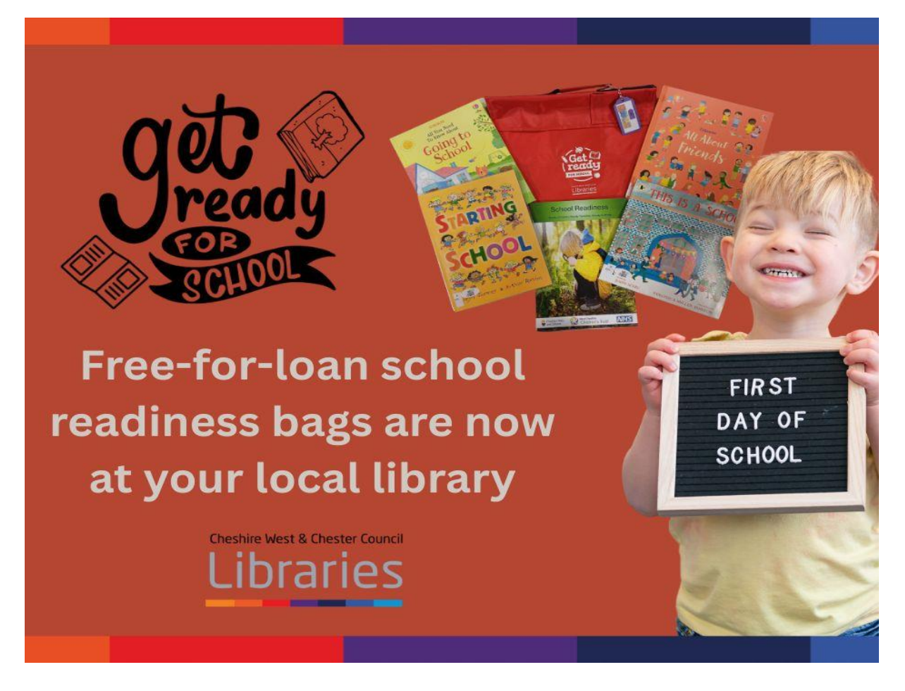
Cheshire West Libraries have just launched "Get Ready for School" bags. These are designed for children who are just about to go to school for the first time. The bags each contain four picture books on the theme as well as useful information for parents. The are 100 bags, with 15 different sets of books. The bags are free to borrow, with there being no fines or reservation charges if borrowed on a child's card.